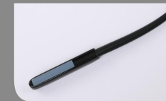
6.5MHz linear rectal probe