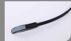
4.0MHz convex rectal probe