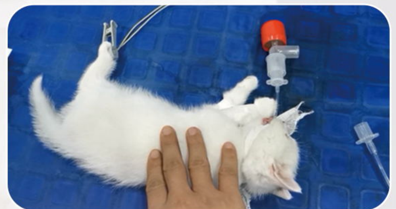
(Pet Apnea Monitor is used to monitor the apnea of a 2-months cat (about 425g) under anesthesia)

Note: Almost all veterinary anesthetic drugs depress respiration in a dose related manner. This makes respiration monitoring an ideal tool to assess the anesthetic depth. Most emergencies during the anesthesia can be attributed to human errors, simply due to lack of vigilance. The Pet Apnea Monitor is always vigilant, not only preventing deaths but allowing better management of every anesthetic.